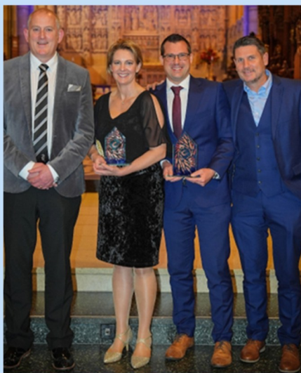
Cornwall Tourism Awards – Truro Cathedral