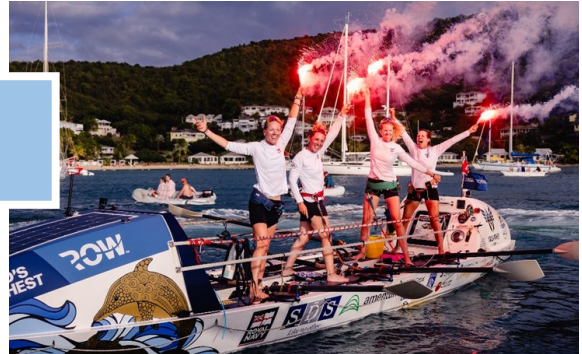
HMS Oardacious Complete the World's Toughest Row

January opened with a strong beneficiary focus. The Royal Navy Charity Forum convened to coordinate support for the forthcoming Highmast Carrier Strike Group deployment scheduled for April. At the same time, our commitment to HMS TAMAR remained front and centre, with the Affiliation Support Group meeting to ensure continuity of engagement.