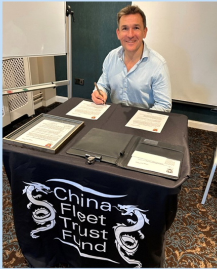
47 Cdo CO – Col Karl Gray Visit