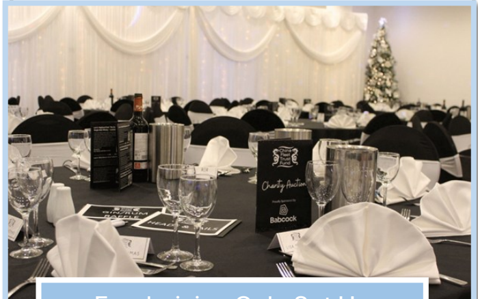
Fundraising Gala Set Up

Governance and operational priorities included the extraordinary 85th meeting of Trustees, the audit closing meeting, and a visit from the Commanding Officers' Designate Course. We were proud to attend the Cornwall Tourism Awards, where the Club was recognised with awards in two categories. Additional highlights included support for the Hands Across the Sea Powerlifting Event and hosting the RNRMC's CEO and Partnership Director.