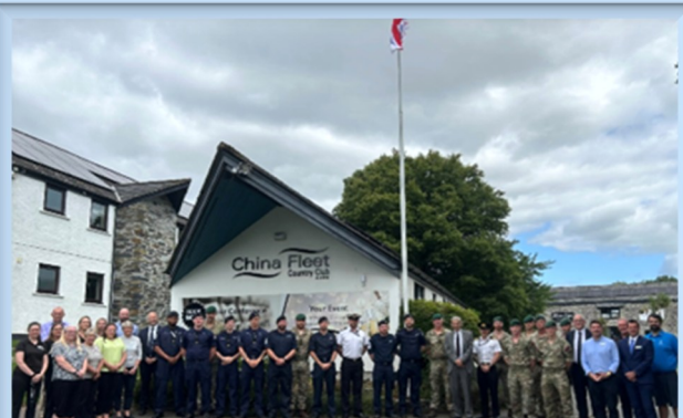
AFD Flag Raising Event