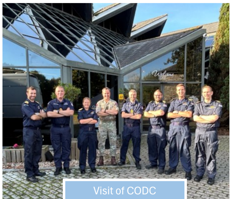
Visit of CODC