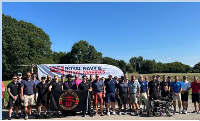
RNRC Hasler Charity Golf Day at the Club