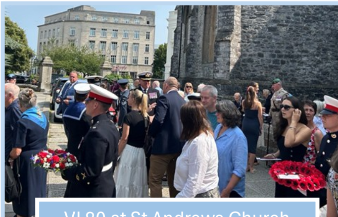
VJ 80 at St Andrews Church