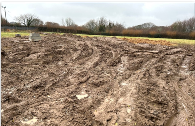
600kWp System Installation Preparation Fortunately this was our neighbour's land and not the golf course!

Finally, governance remained a priority with the 108th meeting of the Beneficiary Committee (BenCom) taking place, reaffirming our commitment to robust oversight and beneficiary-led decision-making.