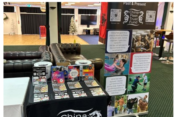
820 NAS Homecoming Set Up