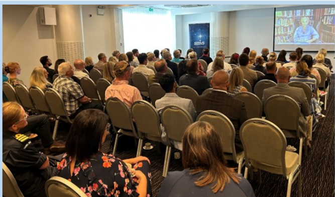
NCC 200 th Anniversary Celebrations