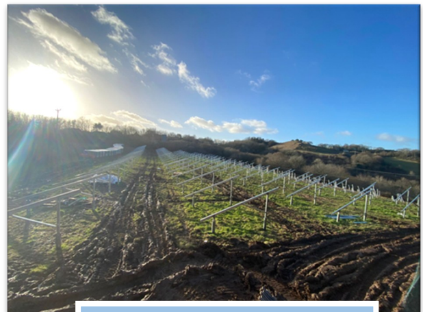
Solar Frames Installation