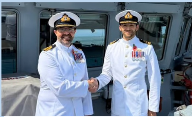
HMS TAMAR Command Handover