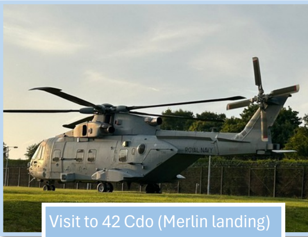
Visit to 42 Cdo (Merlin landing)