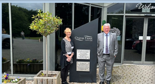
Saltash Cornwall Councillors Visit

Operationally, internal investigation work commenced into accounting and VAT discrepancies, ensuring compliance and financial accuracy moving forward.