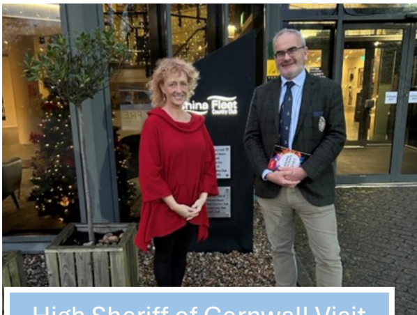
High Sheriff of Cornwall Visit