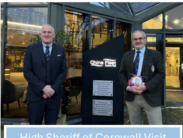
High Sheriff of Cornwall Visit